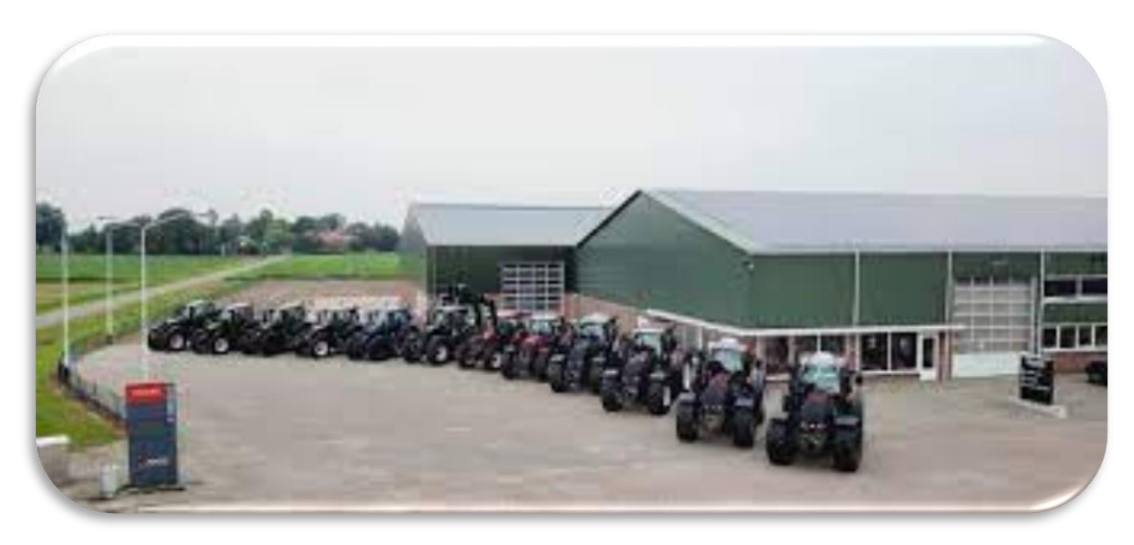
Figure 3: company P. Kriesels Landbouwtechniek B.V. in Wouw.

More information is available at: <a href="https://spise.julius-kuehn.de/">https://spise.julius-kuehn.de/</a>