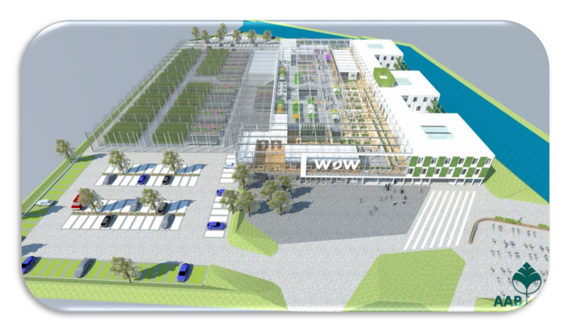
Figure 2: World Horti Center in Naaldwijk

The three-day workshop will be held at World Horti Center, Europa 1, 2672 ZX Naaldwijk The Netherlands. Practical demonstrations related to PAE used in horticulture will organized in WHC. Practical demonstrations related to PAE used in field-crops and orchards will be organized at a SKL workshop located south in the country at the company P. Kriesels Landbouwtechniek B.V. in Wouw.